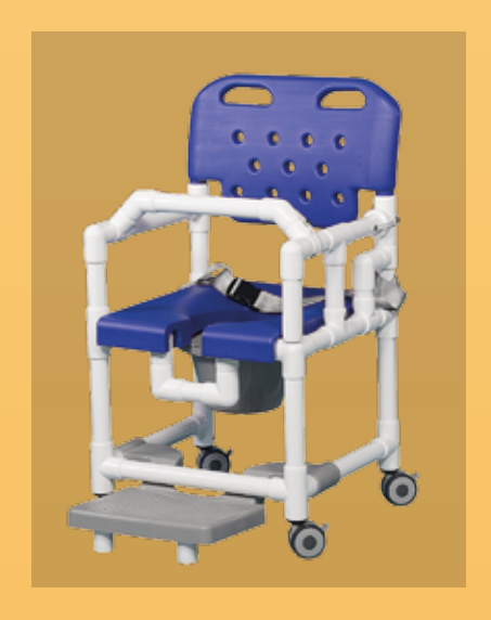
ELT 817 P FR LB SB ELT 820 P FR LB SB