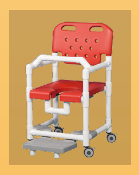
ELT 820 FR LBslide-out, anti-tip footrest FRlap bar LB