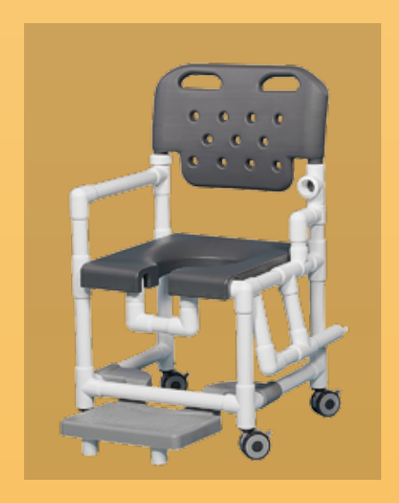
ELT 817 FR LDA ELT 820 FR LDA