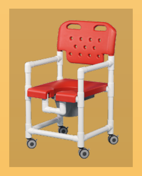
ELT 817 P ELT 820 P • pail with inside scale P