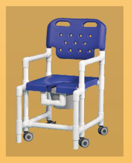
ELT 817 P AT ELT 820 P AT